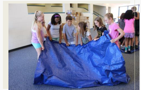
Sixth Graders working together to solve the puzzle.