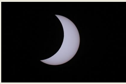
Partial Solar Eclipse as seen by many in Tucson and Oro Valley.